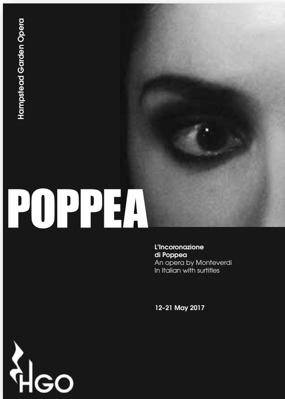
Programme cover - May 2017